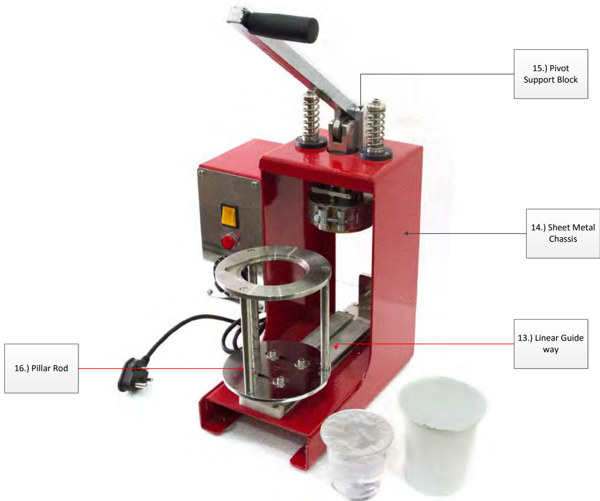
Figure 2: Component Descriptions 13-16