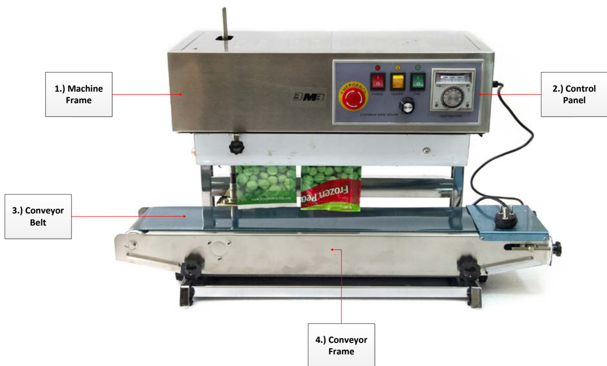
Figure 1: Component Descriptions 1-4

Figures 1, 2 and 3 shown below will familiarize you with the various parts of the FR-900V