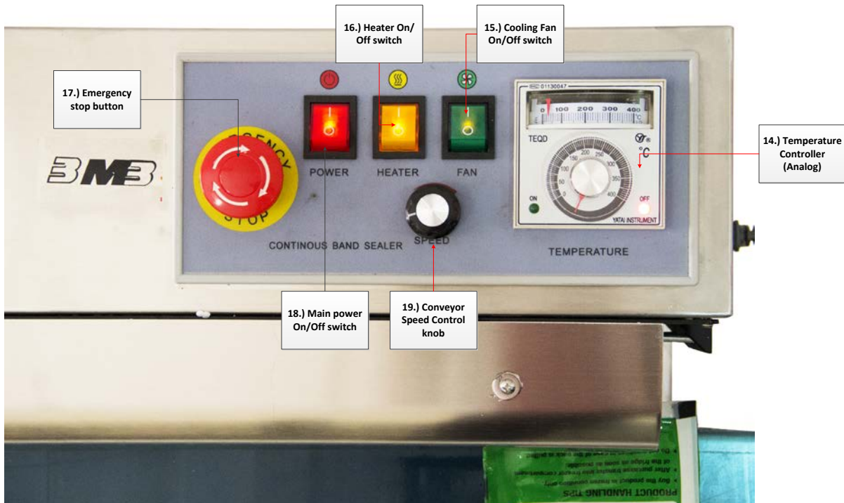
Figure 3: Component Descriptions 14-19