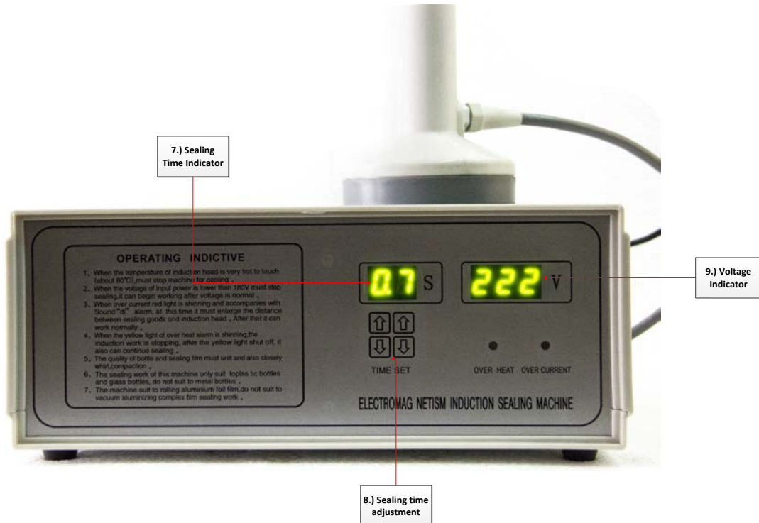
Figure 3: Component Descriptions 7-9