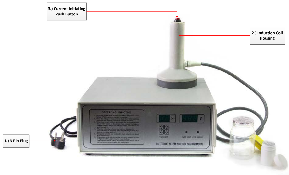
Figure 1: Component Descriptions 1-3

Figures 1, 2 and 3 shown below will familiarise you with the various components that make up the ISP 500A and 500C; however all the three figures show the 500A variant.